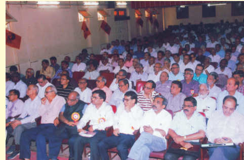
House full of Member Audience.